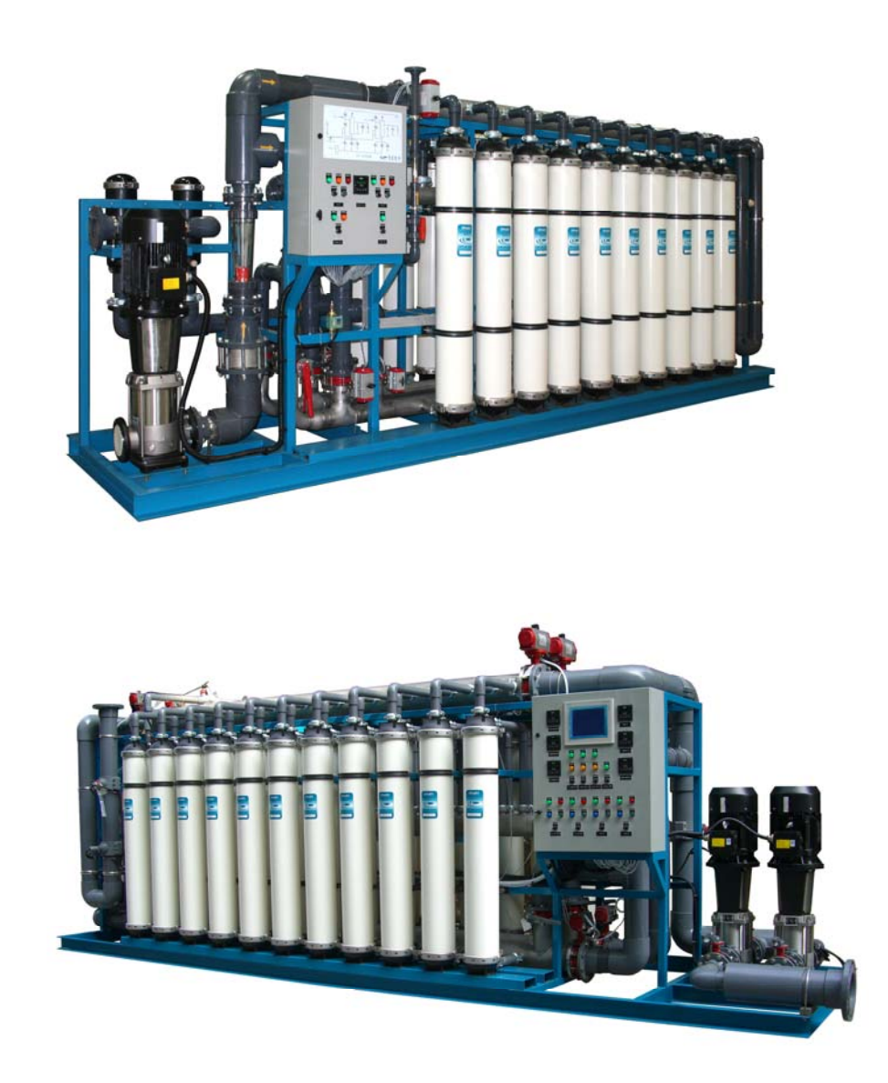
Typical Ultrafiltration machines with OAPmod60-9 elements, arrange in two trains complete with backwash pump(s).